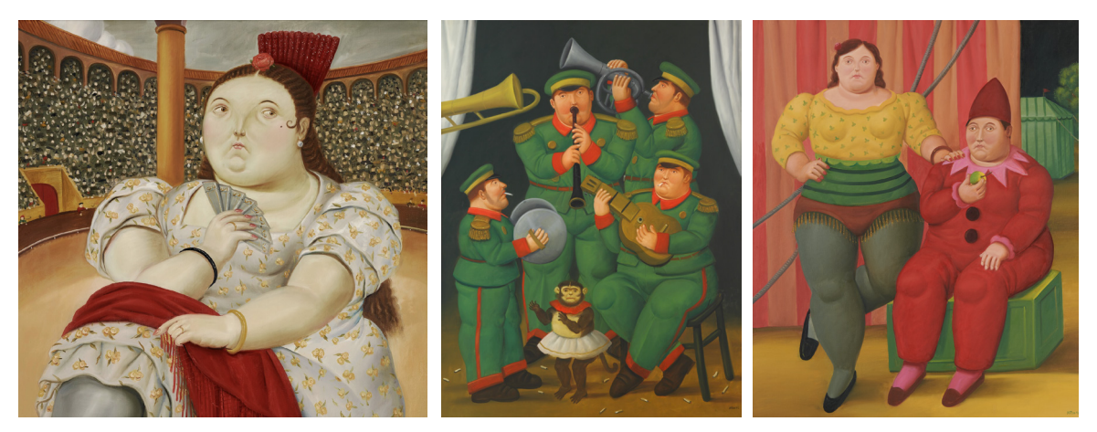
(L-R) Fernando Botero, En La Plaza, 1987; Circus Band, 2008; Circus People, 2008

Opening Reception: December 4, 2023, 6-8pm